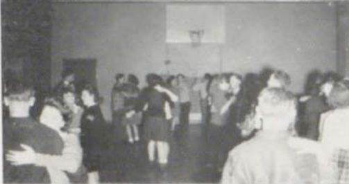
Watch the birdie!