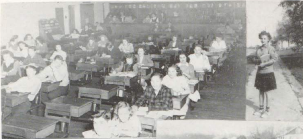
Studying ? ?