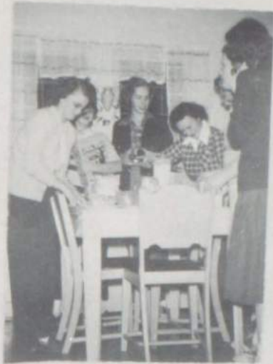
2. K P (Party)