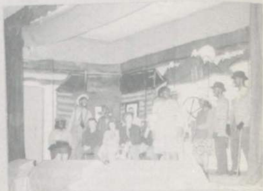
The Whole Family