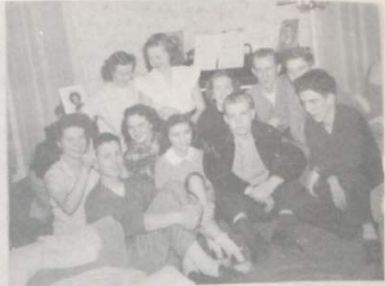
The Gang I