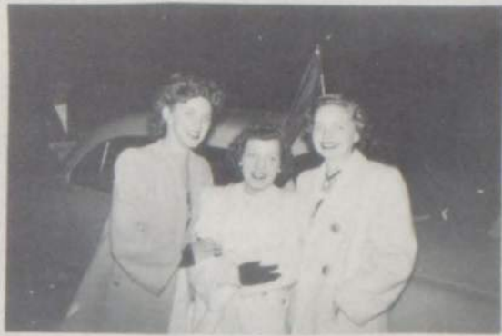
The Queen and her attendants ↖