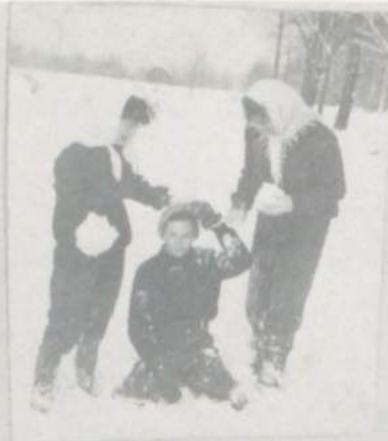
You'll be sorry