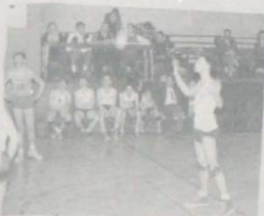
5. He made it too