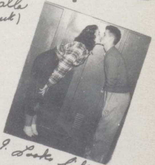
9. Looks like fun