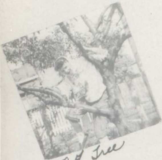
1. up A tree