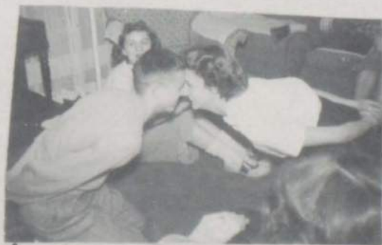
8. He gets around.