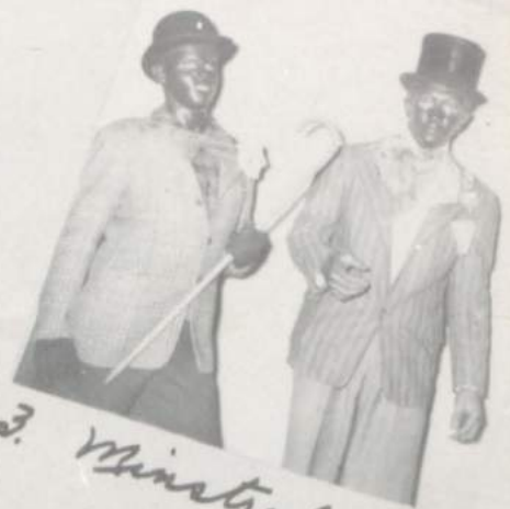
3. Minstrel Days