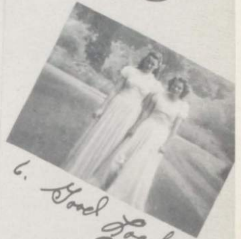
6. Good Looking ?