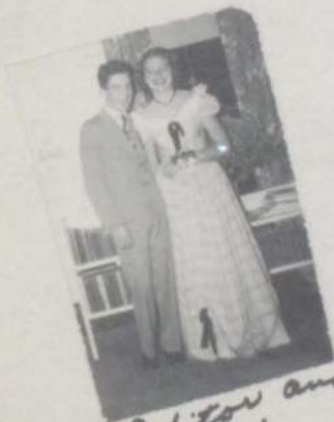
7. Editor and Chief.