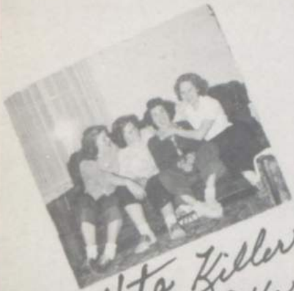
1. That a Killer Ha! Ha!