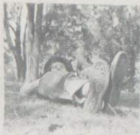
2. Big Feet