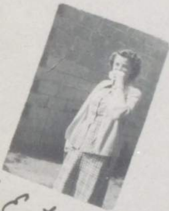
4. Eating again