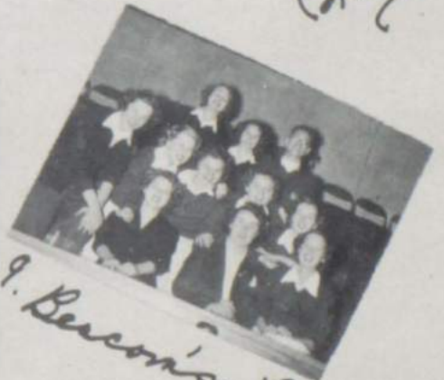
9. Bercom's Last Stand