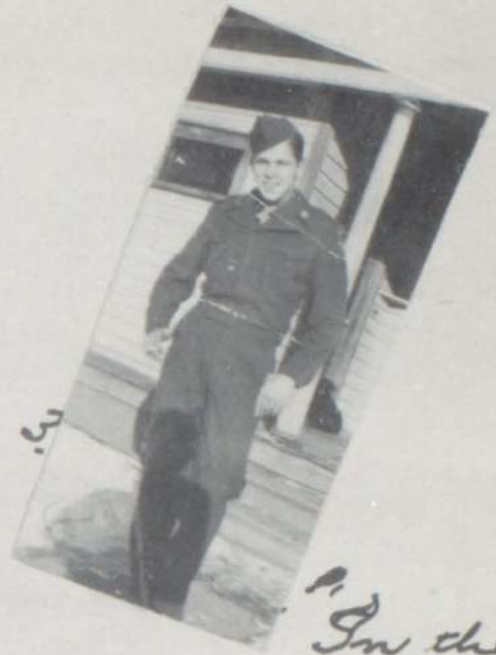
3. "In the Army"