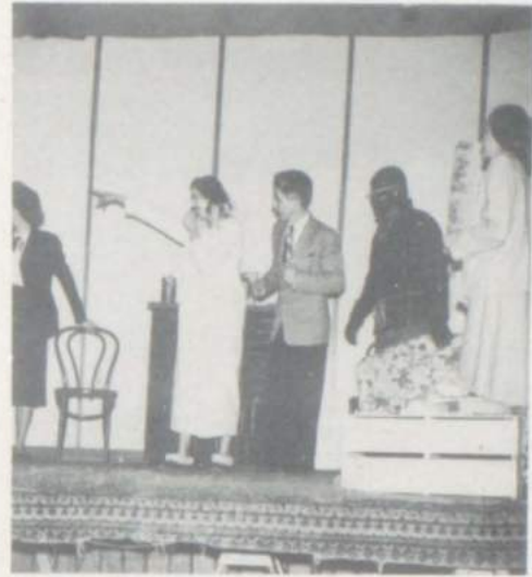
TROUBLE IN PARADISE