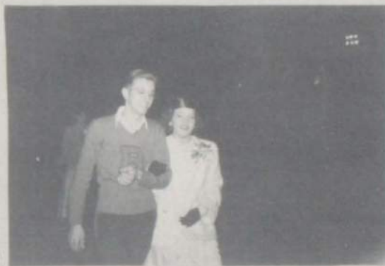
↖ Royal Escort