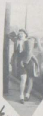
6. Shame, Shame on You (rev.)