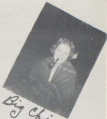
3. Big Chief Phenix