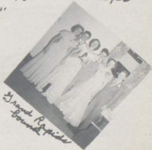
12. Grand Rapids Bunch