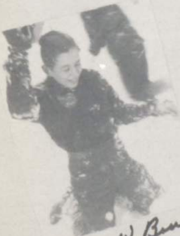
10. Snow Bunsel