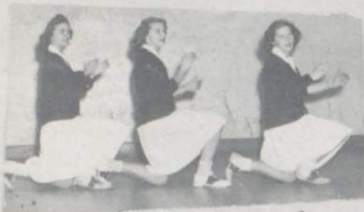
3 of a Kind