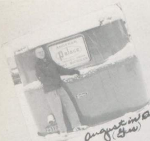
1. August in Ice (Gus)