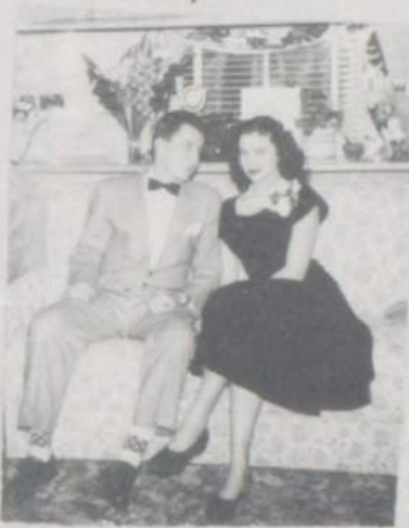
5. Think Look grand