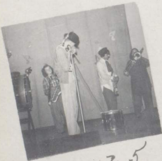
7. Hungry 2 5.