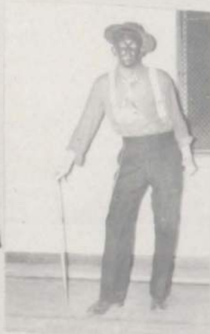
8. Just Mr. Nobody