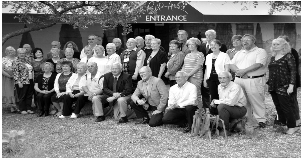
35 Graduates of the Class of 1963